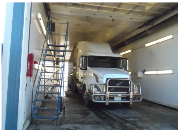
Trailer wash facility.

In adapting the approach for the hog industry, researchers ran trials on factors like velocity and hose size and worked on automating the system to make it user-friendly. Also, to ensure that all dangerous pathogens are deactivated, they spoke to veterinarians and conducted literature reviews around the best means for killing swine pathogens.