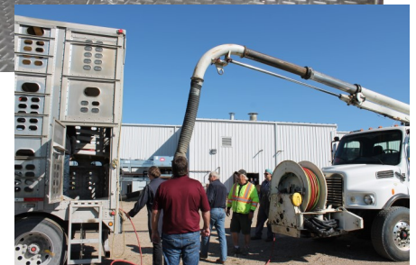
Above: condition of trailer floor after flood wash. Below: truck wash equipment.